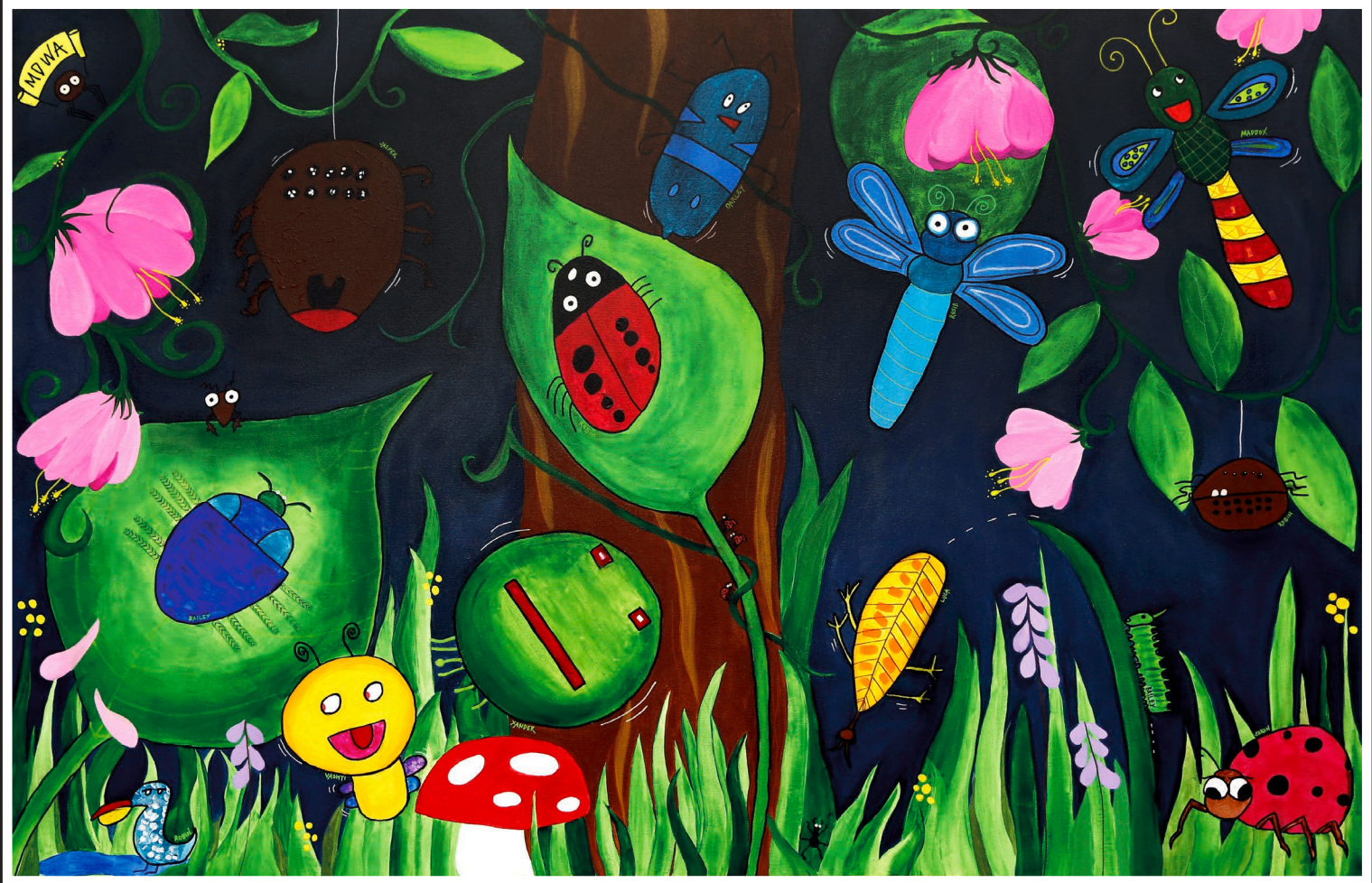
This artwork was made by our MDWA kids at our annual camp, with thanks to PlayWorks.